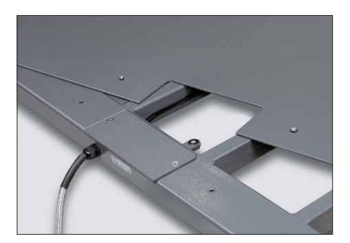
■ Weighing plate can be unscrewed - The weighing plate can be conveniently unscrewed for maintenance or cleaning purposes (Exception: BFC 6T-3M)