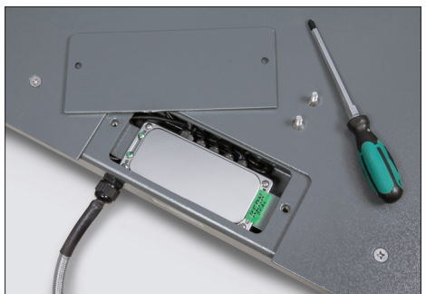
Easy levelling of the weighing bridge as well as access to the junction box from above