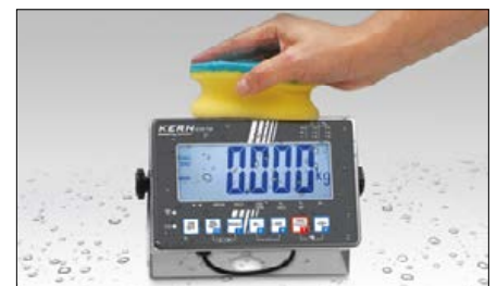
Stainless steel display device with protection IP68, hygienic and easy to clean