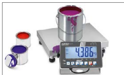
Durable stainless steel weighing plate